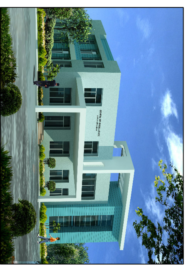
FRONT ELEVATION (NORTH SIDE ELEVATION)