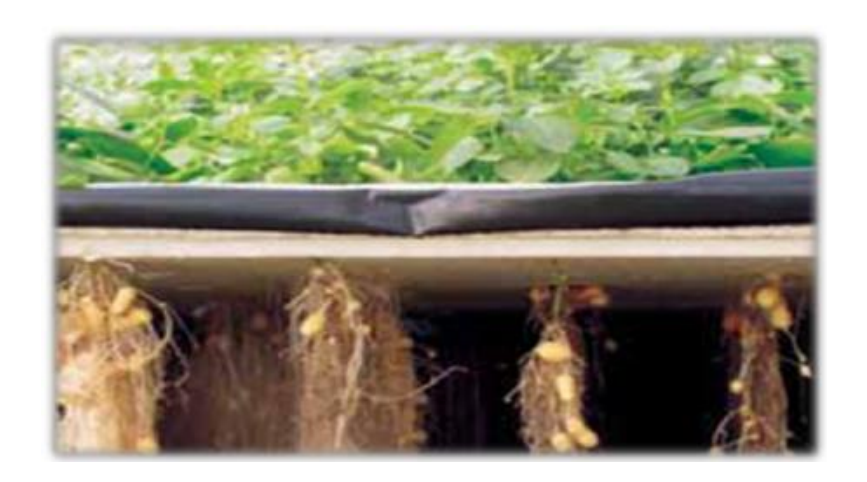
Floating technique (Ebb and flow)