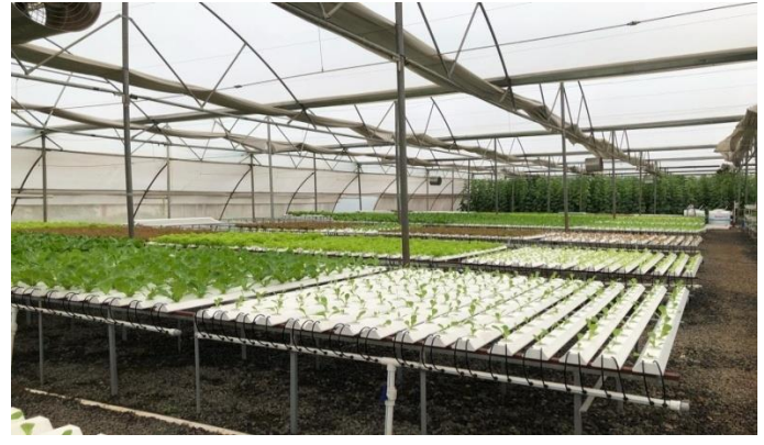
Deep flow technique (DFT) or Deep water culture (DWC)