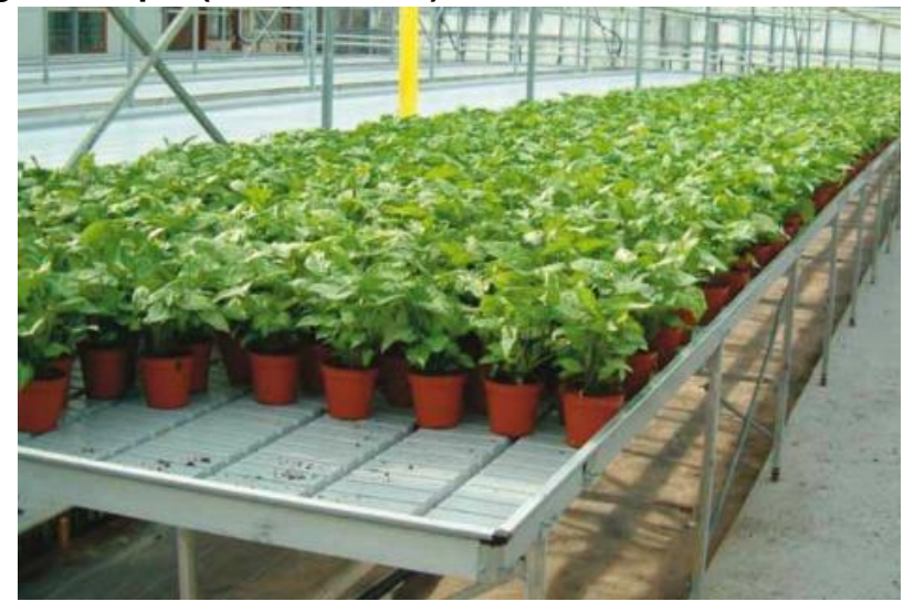
Capillary action technique (Wick Method)